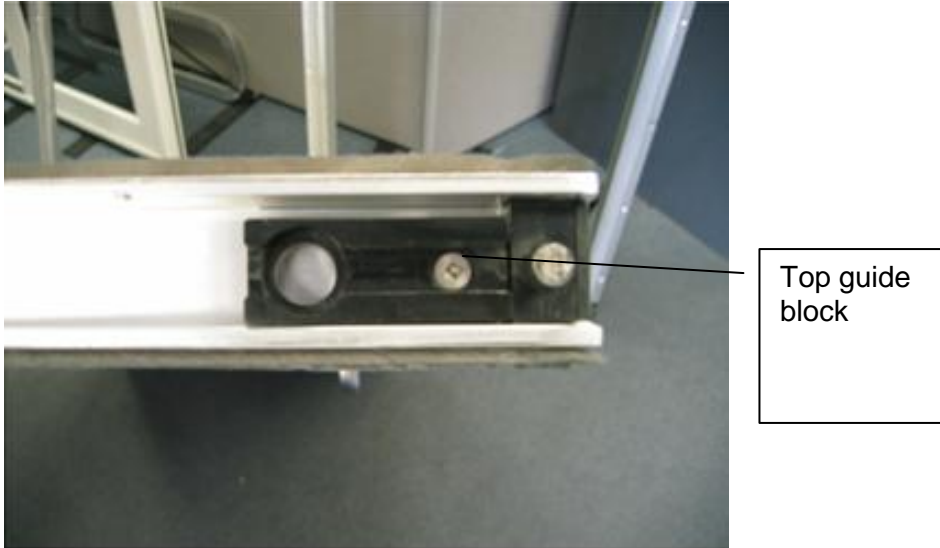
Figure 6 - Top Glide Block