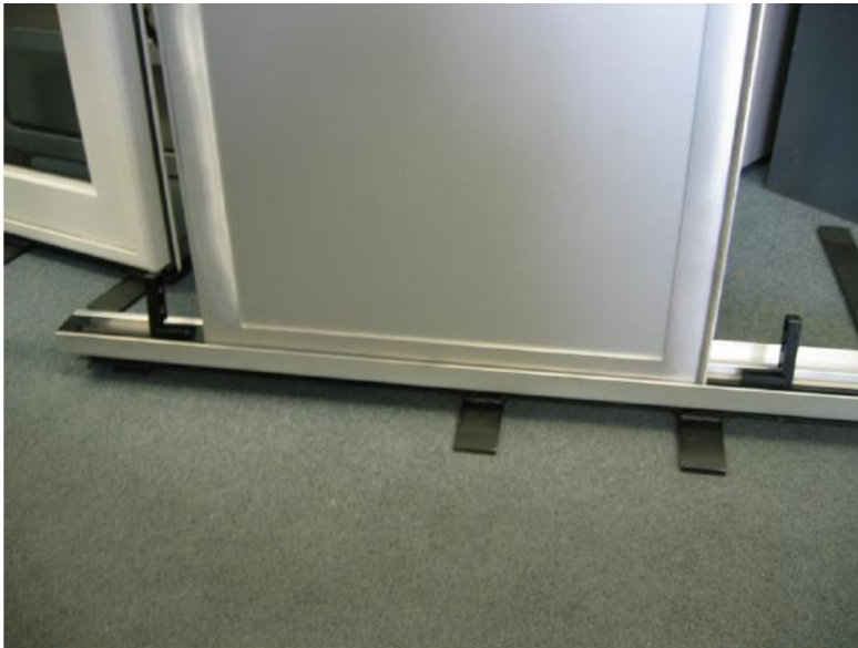
Figure 4 – Bottom of door showing the forward and aft glide blocks removed.