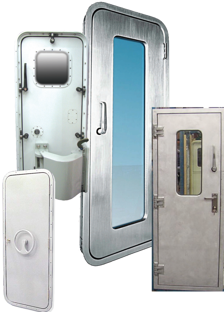
Four styles of Quick-Acting doors.